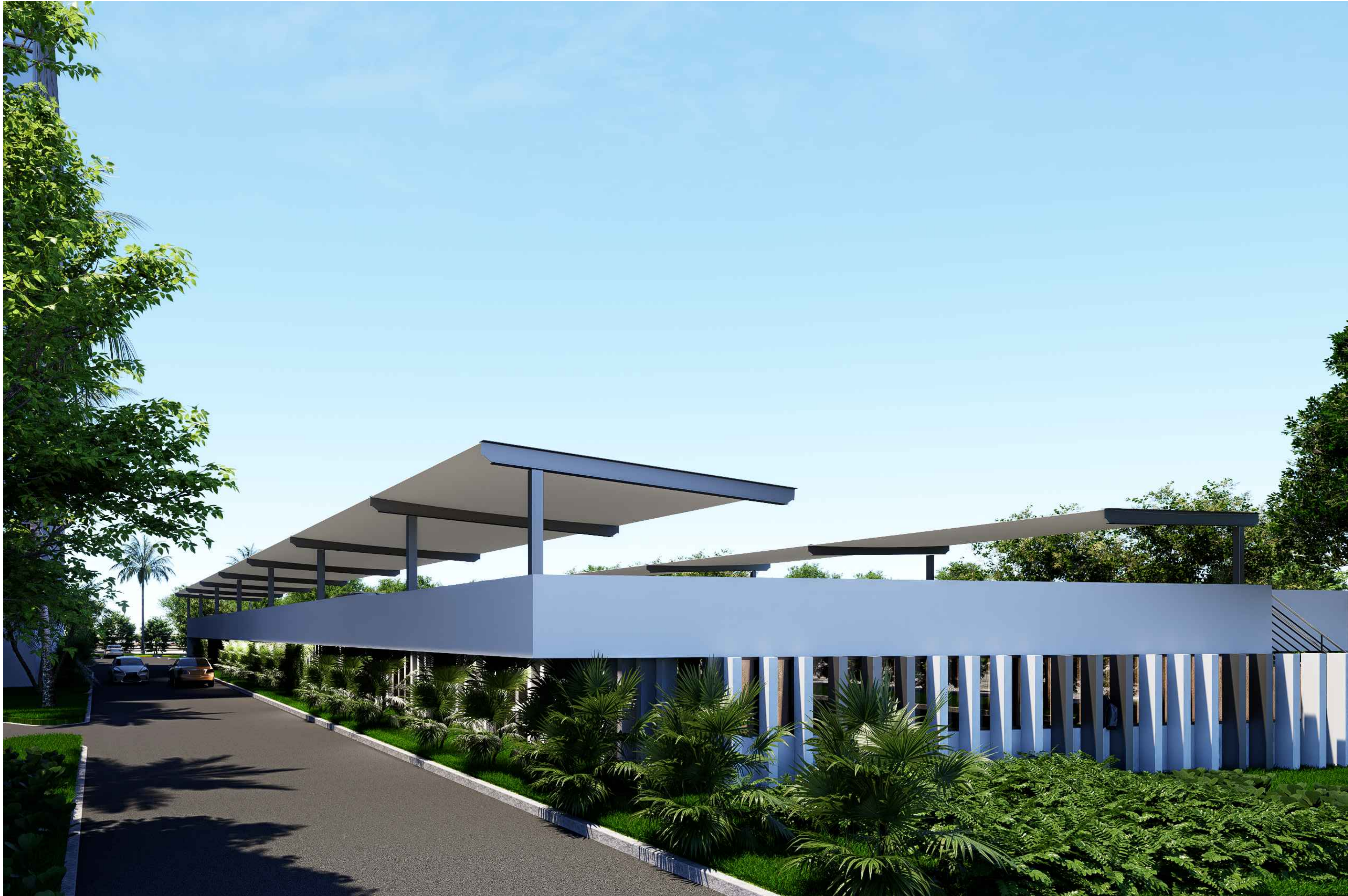
2-STORY PARKING STRUCTURE